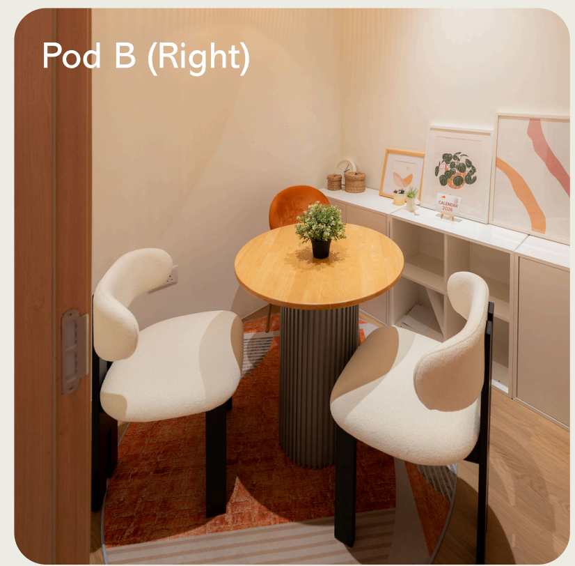
Pod B (Right)