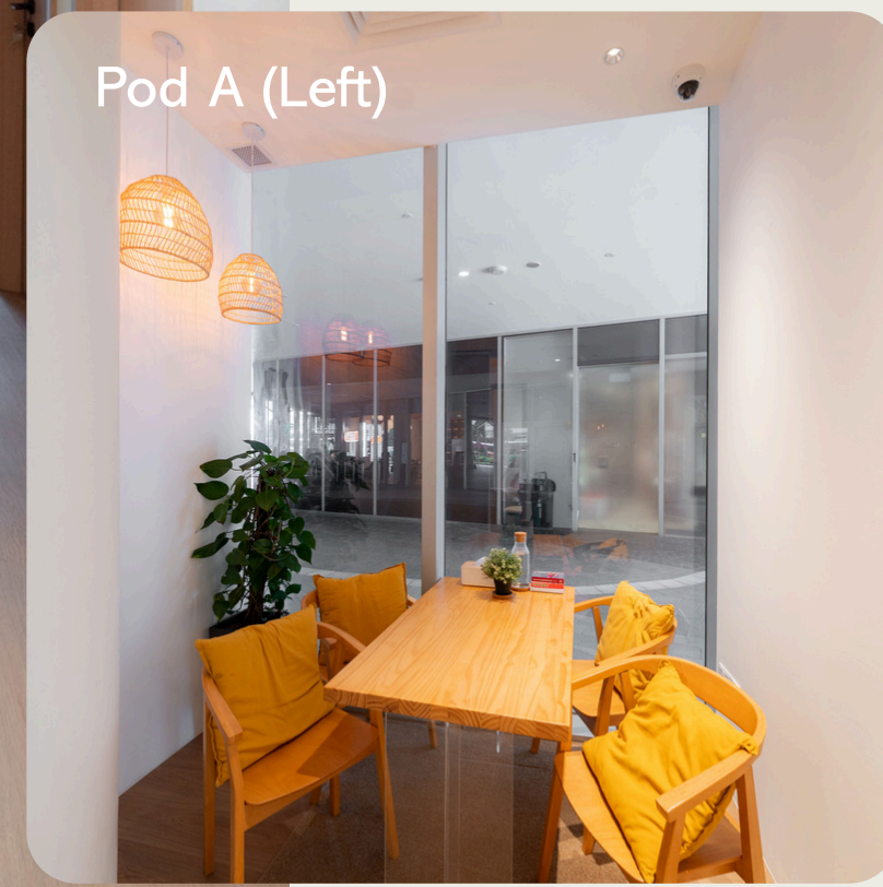
Pod A (Left)